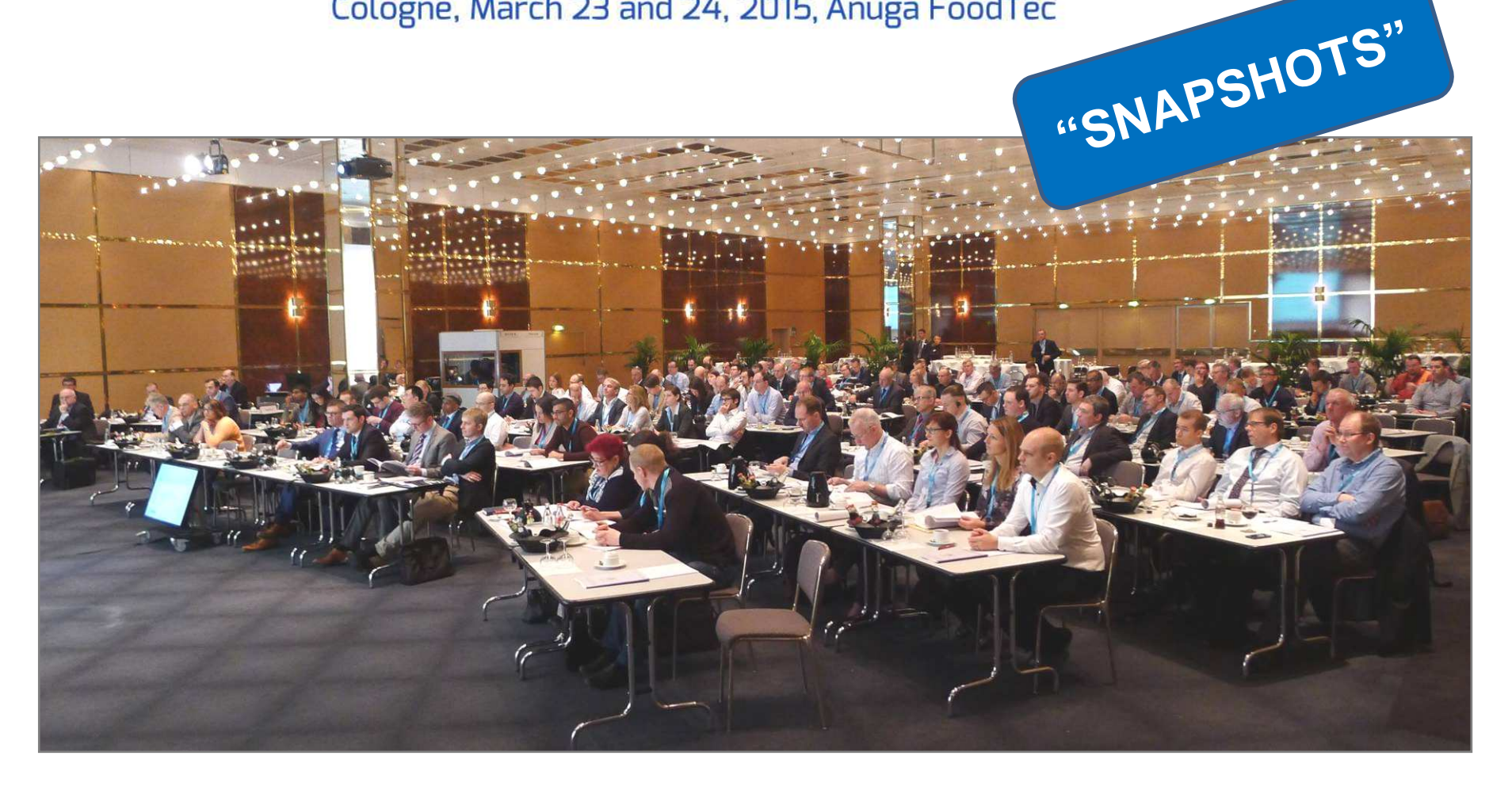
Cologne, Anuga FoodTec Fair Ground / Germany

Cologne, March 23 and 24, 2015, Anuga FoodTec